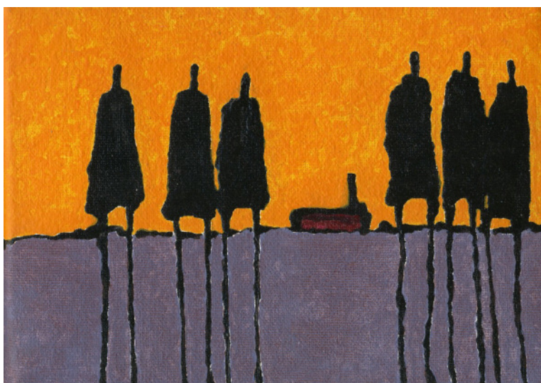
Jan Swinburne, Six Figures , 2004