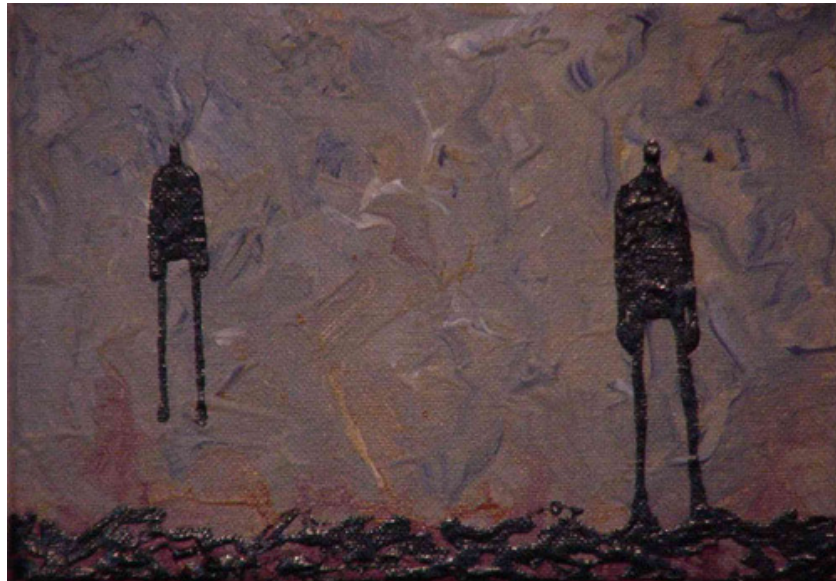
Jan Swinburne, Stormsky

The three models presented are examples of the core objectives of art facilitation as an inclusive, supportive and pragmatic practice.